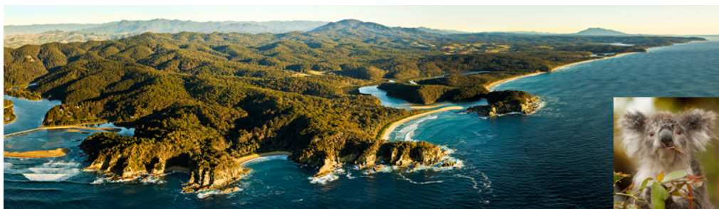
From the Bega River mouth to Mumbulla and Gulaga Mountains